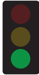
THE GREEN ZONE

ASK YOURSELF, “What is it like when I am in...”