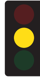
THE YELLOW ZONE